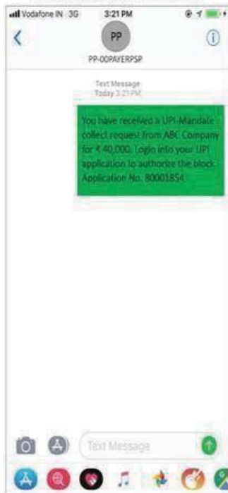
Block request SMS to investor